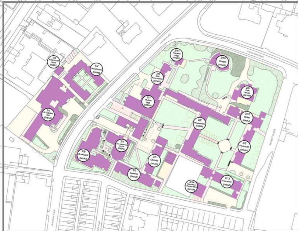
VICTORIA CAMPUS - BUILDING / LANDSCAPE DRAWING KEY